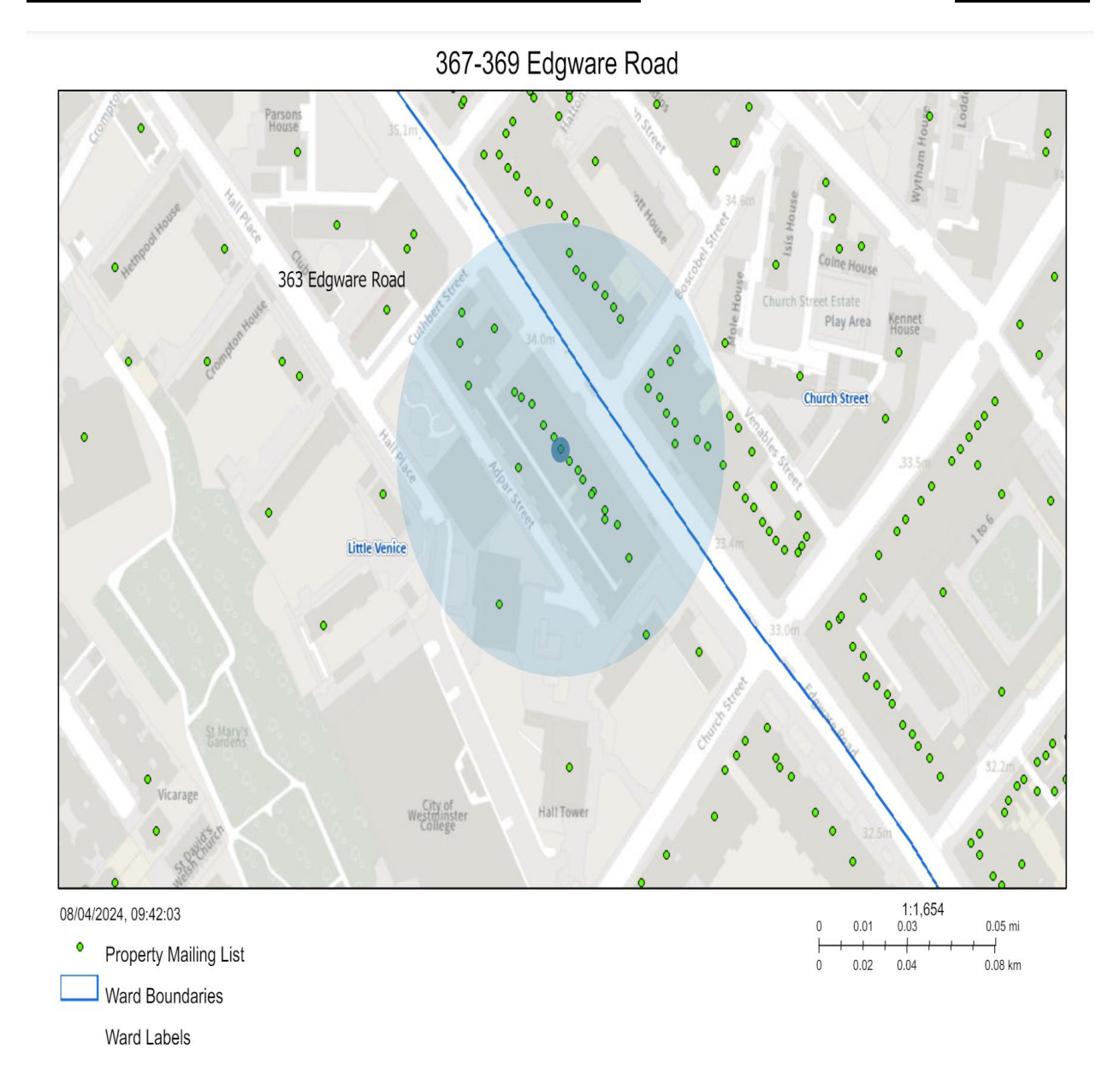
Resident Count: 341